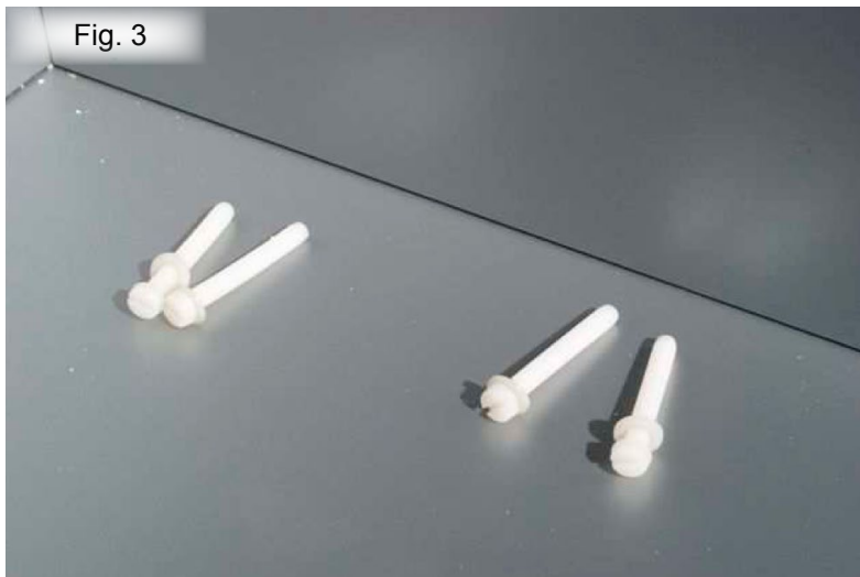
The 4 PVC screws.